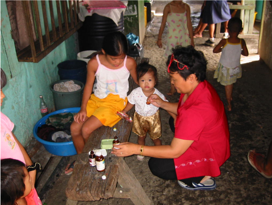
A “bodega binhi” mini-pharmacy gives free medicine to children with tuberculosis in Tondo, Manila